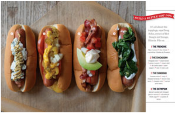
Click here for a larger image