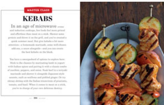
Click here for a larger image