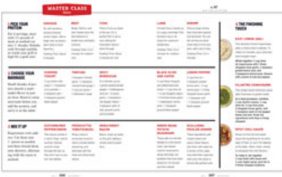
Click here for a larger image