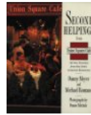
Second Helpings from Union Square Cafe