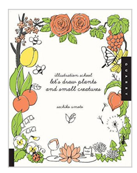
Illustration School: Let's Draw Plants and Small Creatures